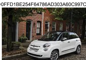
Shopping for a New Car? Don't Waste Your Money on One of These 15 (Forbes)

PC=OUTYRPEA28&CC=3A15&sc_campaign=0FFD1BE254F64786AD303A60C997CFE8) http://lifefactopia.com/shopping/glf/?mb=0cp&sub=us-golf&aid=g4-misc ( http://tcgtrkr.com/?a=163&oc=1&c=246&article=public-records ) ( http://www3.forbes.com/business/15-new-cars-to-avoid/?utm_campaign=cars-to-