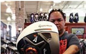
Must-Have TaylorMade Drivers Being Sold for Next to Nothing (LifeFactopia)

http://servedby.flashtalking.com/click/4/46626;1223898;369307;211;0/?ft_width=1&ft_height=1&url=6938765 http://www.ancestry.com/s63188/t31766/rd.ashx http://www.fisherinvestments.com/your-retirement/15-minute-retirement-plan?