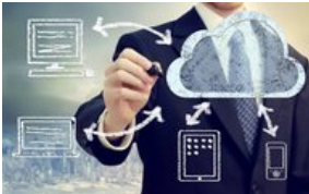
The 3 Most Common Concerns About the Cloud (ShoreTel)