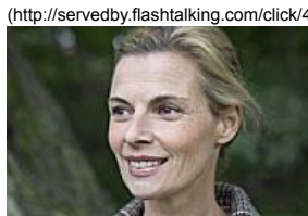
4 Ways to Avoid Running Out of Money in Retirement (Fisher Investments)

http://servedby.flashtalking.com/click/4/46626;1223898;369307;211;0/?ft_width=1&ft_height=1&url=6938765 http://www.ancestry.com/s63188/t31766/rd.ashx http://www.fisherinvestments.com/your-retirement/15-minute-retirement-plan?