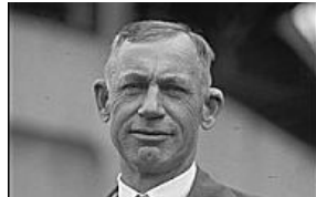
What's the Most Common Last Name in the United States? (Ancestry)